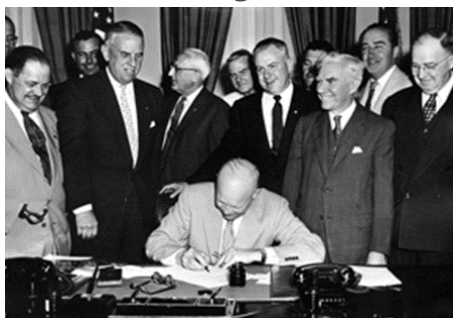
President Eisenhower Signs HR7766 - Veterans Day

President Wilson proclaimed these words at the first commemoration of Armistice Day, “To us in America, the reflections of Armistice Day will be filled with solemn pride in the heroism of those who died in the country’s service and with gratitude for the